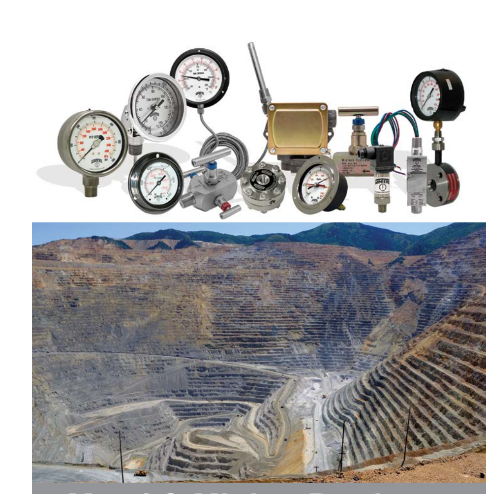
Metal & Mining Products